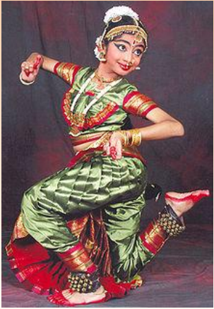
Bharatnatyam Tamil nadu