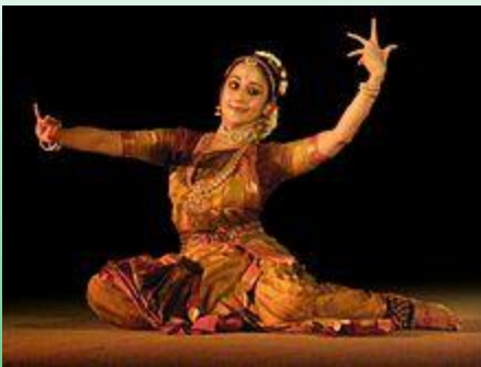
Kuchipudi (andhra pradesh)