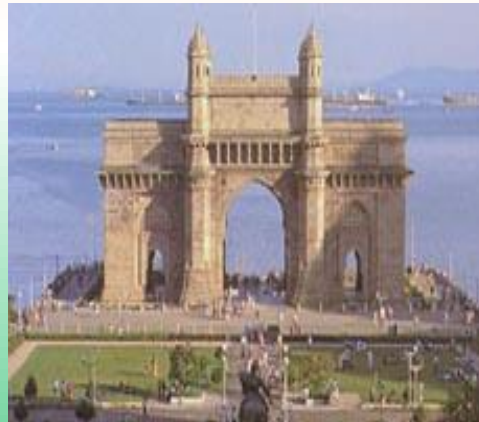
Gate Way Of India